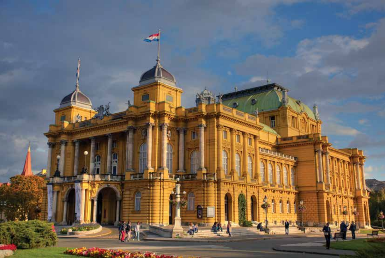
Croatian National Theatre