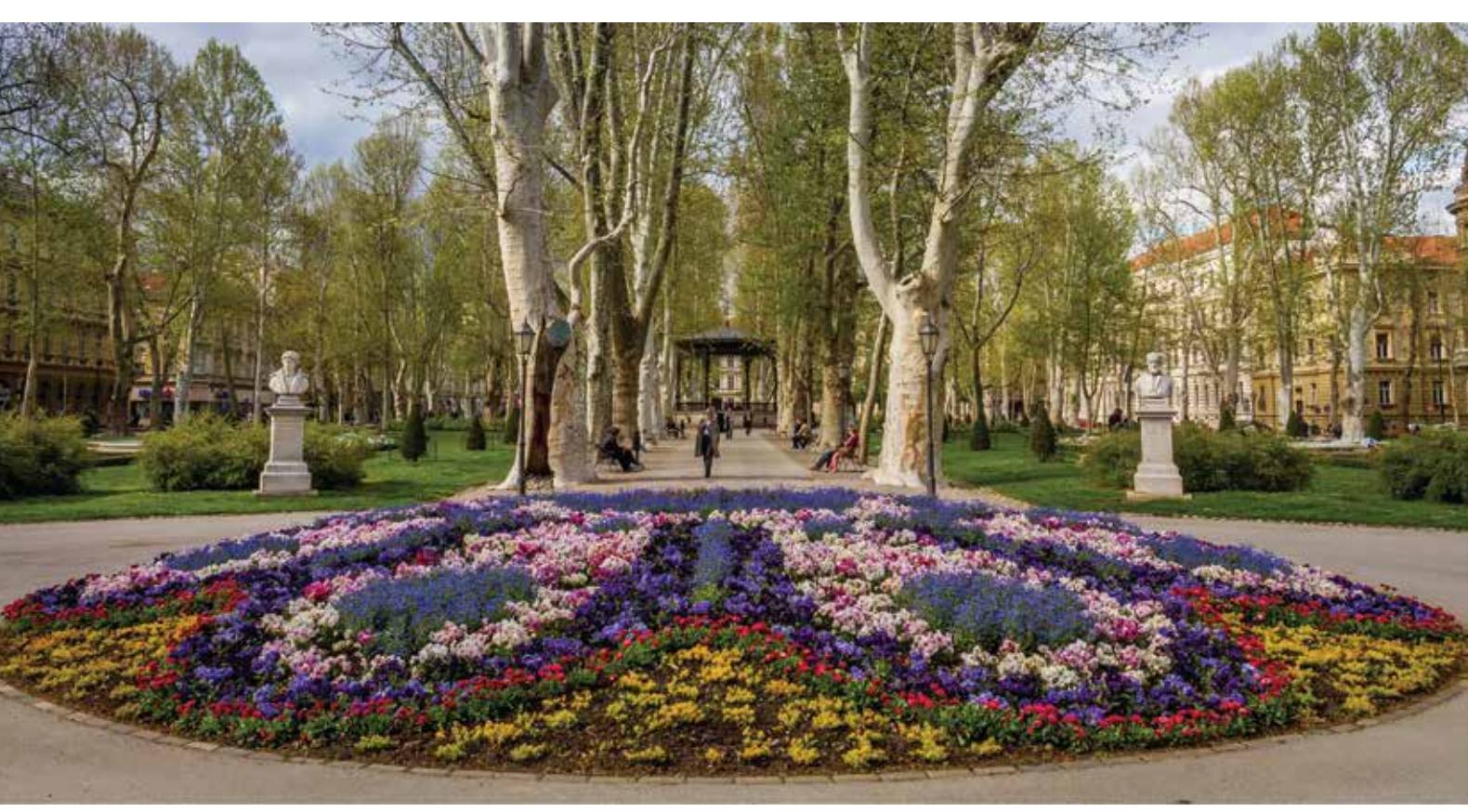
Zrinjevac Park